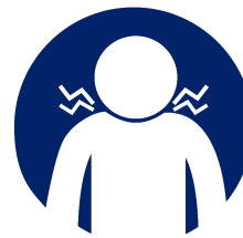
TIGĀ LE FA'AI