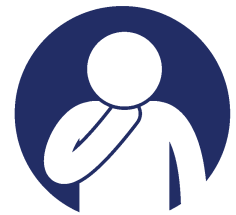
SUSAR DADA IIS