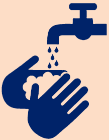
FULU FAELOA LIMA KI SOPU MO VAI

Te auala lei ke puipui te pisi o te masaki ko te tuu maa: