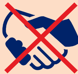
FAKAGATA TE FAKAPILIPILI KI NISI TINO